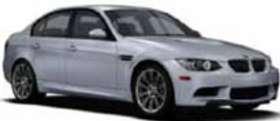
BMW M3 Sedan

BMW M3 Sedan • BMW Z4 M Roadster • BMW X6 3.5i • or $40,000!