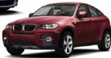
BMW X6 3.5i