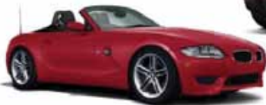
BMW Z4 M Roadster